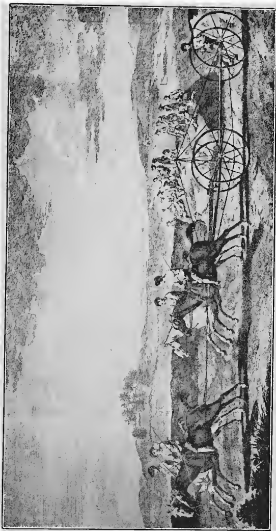
LORDS MARCH AND EGLINTON'S CHAISE MATCH AGAINST TIME, RUN AT NEWMARKET, AUGUST 29TH, 1750.